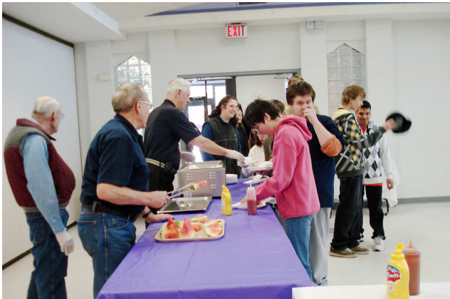
We're ready for SERVICE as the students come.