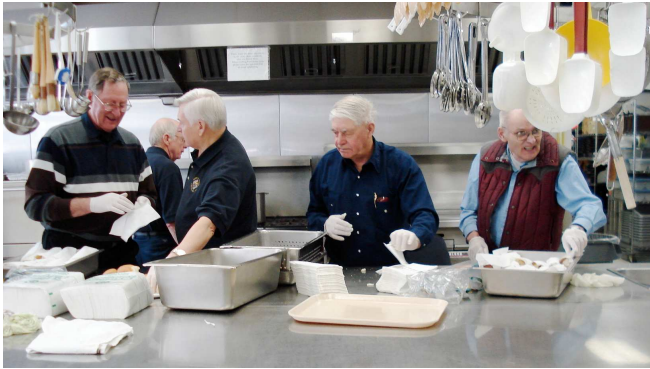
Art says to Eugene, "This is the way to make hot-dogs!"

The Special Needs Luncheon originally scheduled for December 8 th was cancelled and re-scheduled and held on January 12 th .