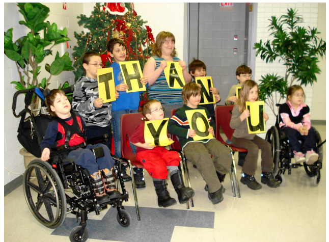
School children with special needs were treated to a Christmas Noon Lunch at St. Gerard's Complex on Tuesday, December 2 nd .

~~~~~ On page 5, you will find a list of the Intercouncil K of C Charity Appeal winners. Also, you will find the 2008 Annual Survey of Fraternal Activity Member Worksheet. Please take the time to fill it out to the best of your ability, cut it off and return it as instructed.