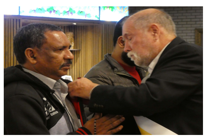
Becoming a Knight